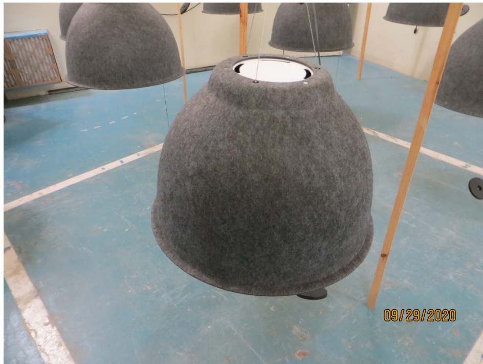
Figure 3 – Detail of shade and fixture material