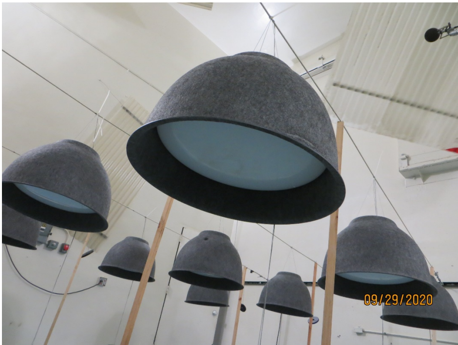
Figure 2 – Underside of individual specimen fixture, acrylic diffuser