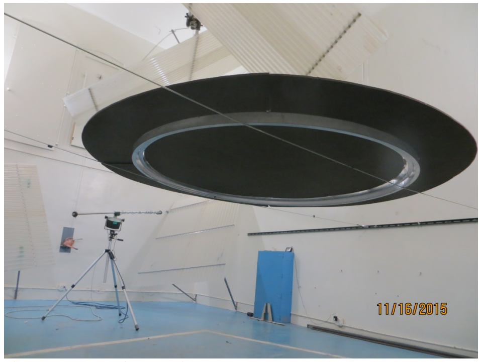
Figure 2 - Bottom of test specimen.