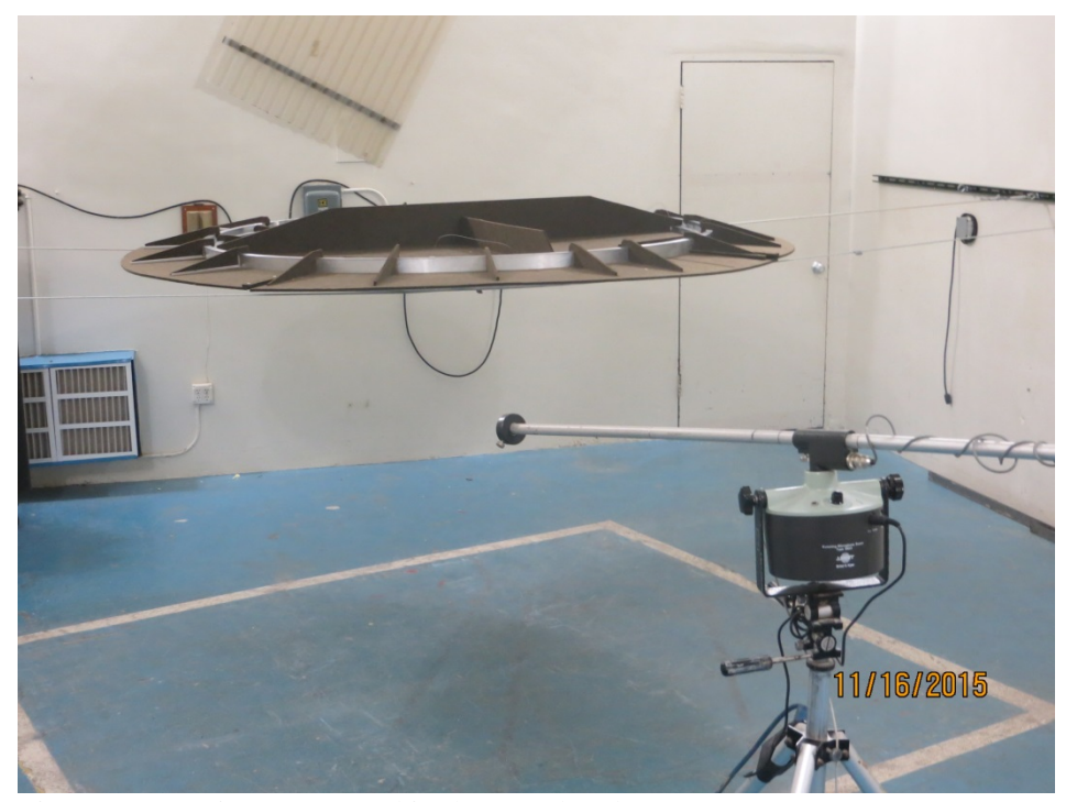
Figure 1 - Specimen mounted in the test chamber.