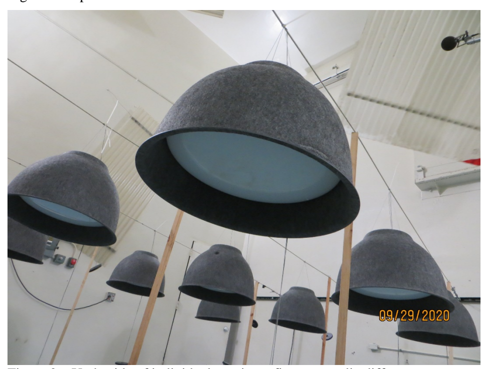
Figure 2 – Underside of individual specimen fixture, acrylic diffusor