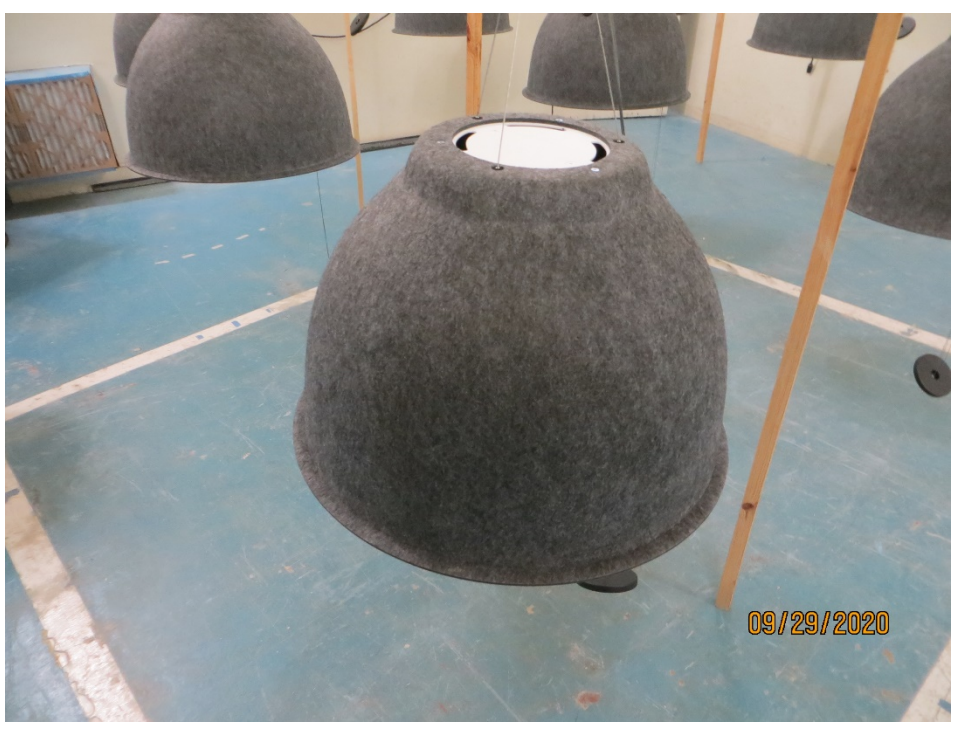
Figure 3 – Detail of shade and fixture material