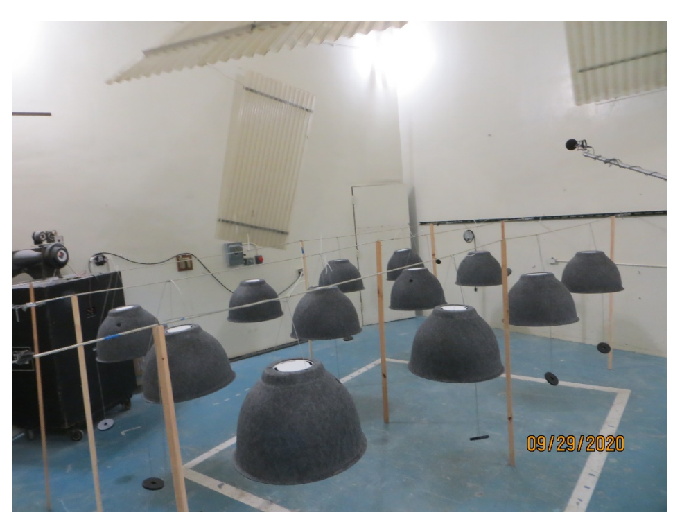
Figure 1 – Specimen mounted in test chamber