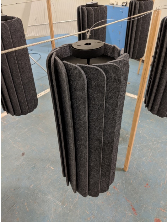
Figure 3 – Detail of specimen materials