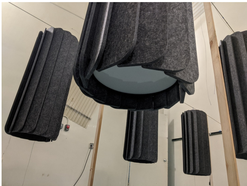
Figure 2 – Detail of specimen material, recessed acrylic lens, felt fins