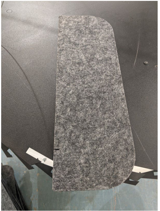
Figure 4 – Individual specimen fin prior to installation to hub