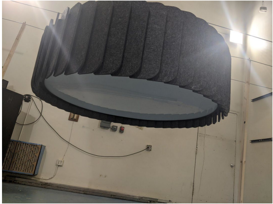
Figure 2 – Specimen mounted in test chamber