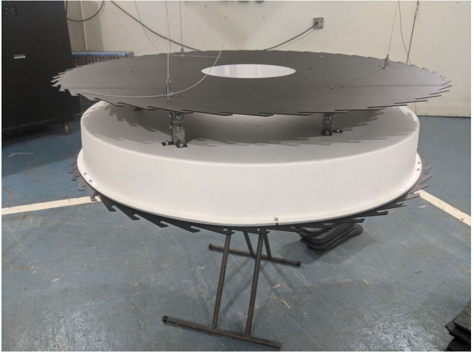
Figure 3 – Specimen top and bottom hubs connected by "V" columns