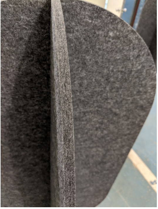
Figure 3 – Detail of specimen material