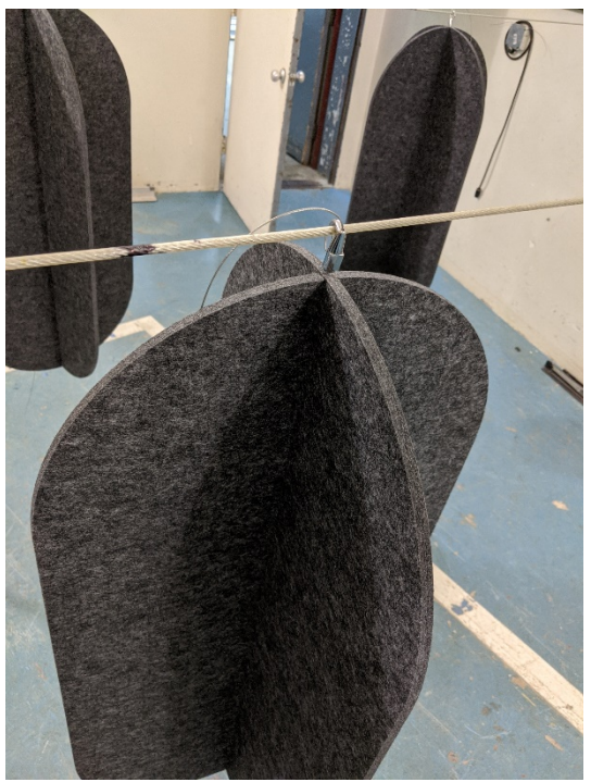
Figure 2 – Detail of specimen material